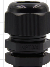
NPT TYPE Material: Nylon