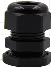
PG TYPE Material: Nylon PA, UL94-V0