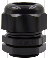
METRIC TYPE Material: Nylon