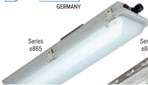
Explosion-Protected LED-Light Fitting for Zones 1 and 21