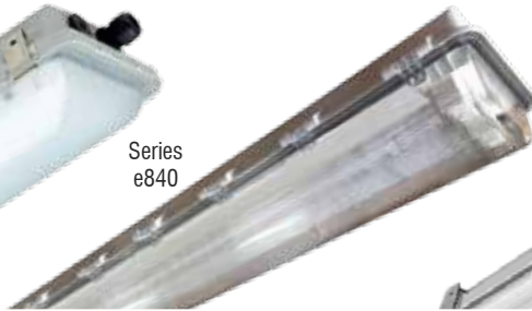
Explosion-Protected Light Fitting for Zones 1, 21 and 2, 22